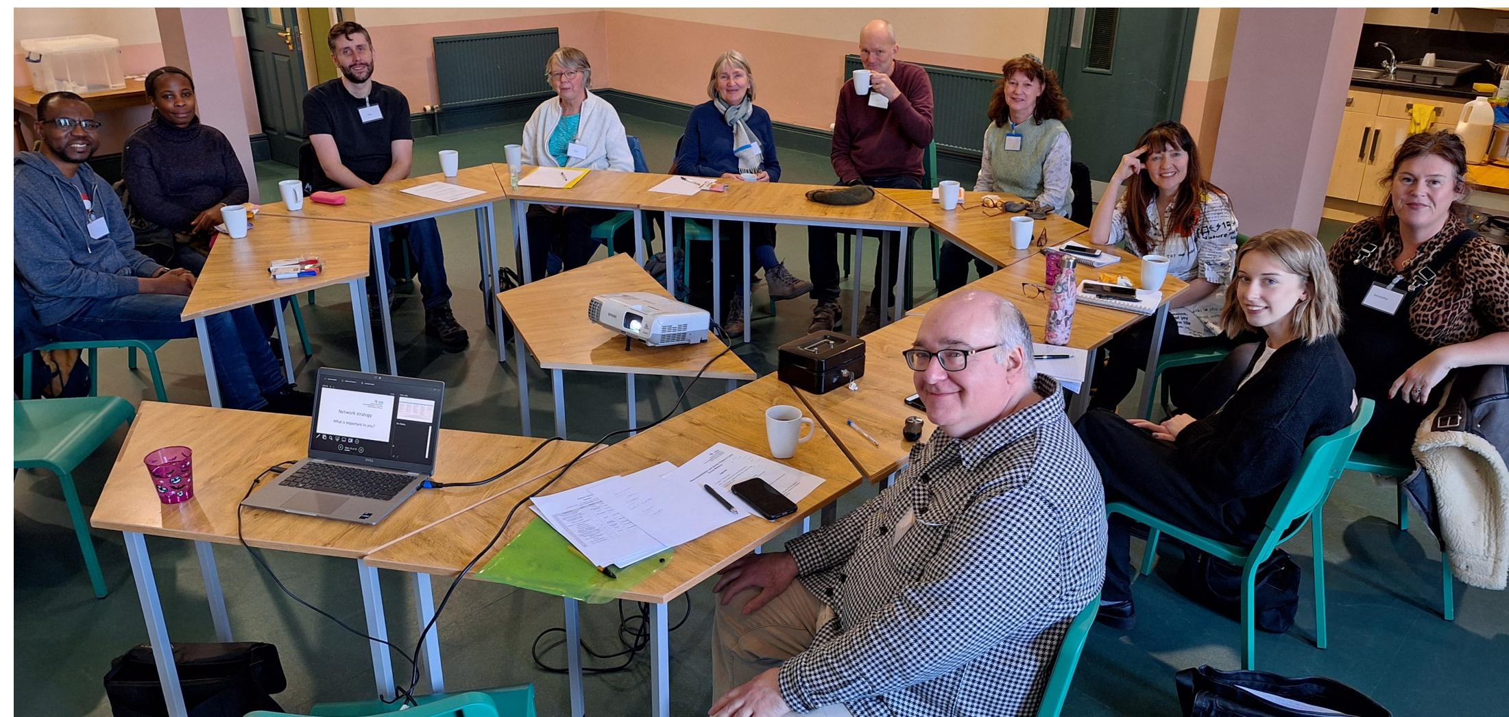
Stroke and Neurorehabilitation Patient and Carer Group meeting