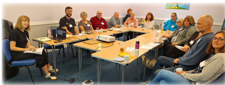
Network Patient and Carer Group

This year, the group also helped design and deliver sex and relationship training to local clinicians.