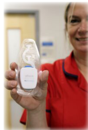
Stepping Hill stroke team have been trialling cardiac monitoring devices

Early diagnosis of Atrial Fibrillation means anti-clotting drugs can be given earlier to reduce the risk of a further stroke.