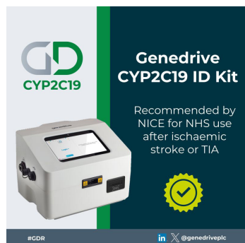
GeneDrive point of care testing device

Salford Royal Hospital stroke team have been piloting genetic testing on their ward.