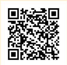
Scan to download this poster